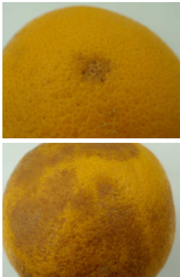
Figure 1. Chilling injury symptoms on Navel orange

Chilling injury can be a devastating postharvest disorder that can occur after low temperature storage which can result in significant downgrade or rejection of fruit in the market. The classical symptoms of chilling injury is pitting of the peel and superficial scald-like symptoms of the peel and browning of the skin (Figure 1).