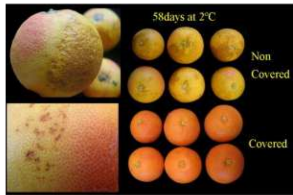
Figure 2. Chilling injury symptoms present in yellow chilling injury -sensitive rind zones/fruit and completely absent in lycopene-containing chilling injury-tolerant rind zones/fruit. From Lado et al. (2015).

Preharvest factors contributing to the development of chilling injury include citrus type and cultivar, preharvest orchard temperatures, harvest times, growing locations etc. The susceptibility to chilling injury differs among species and different citrus types. For example limes and lemons are generally more susceptible to chilling injury than oranges and mandarins. But even within a citrus type, there are differences in susceptibility to chilling injury. For example comparing the susceptibility of different Navel oranges; 'Navelina' fruit have stronger tolerance to chilling temperatures while 'Thomson' are moderately sensitive and 'Navelate' and 'Roberts' fruit are highly sensitive to chilling temperatures (Lindhout, 2007). Grapefruit are one of the citrus types most susceptible to chilling but there are significant differences in susceptibility between red and regular grapefruit types. Lado et al. (2015) showed there is a positive relationship between carotenes content, mainly lycopene, and chilling tolerance during storage of grapefruit at low temperature (Figure 2). The potential protective role of lycopene in chilling injury has been shown to be related to the antioxidant properties of lycopene (Lado et al., 2015).