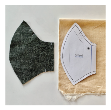
2. Place pattern on fabric and cut two outer pieces. Mark fabric where all black boxes appear in seam allowance (SA). Fold pattern on blue dashed line and cut two lining pieces. Mark fabric where all blue boxes appear in SA.

1. Wash fabric in hot water and dry on high heat before sewing. Press fabric.