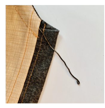
11. Insert wire into wire channel and bend to fit nose. Insert ties into the tie channel (a tweezer helps).