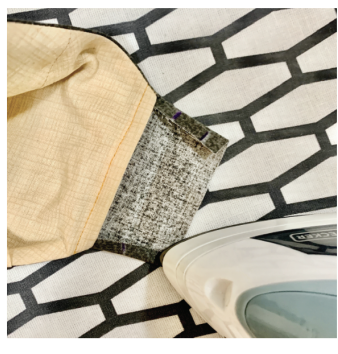
8. Fold the 1/4" SA on the top and bottom of the outer piece down and re-press the tie channel.