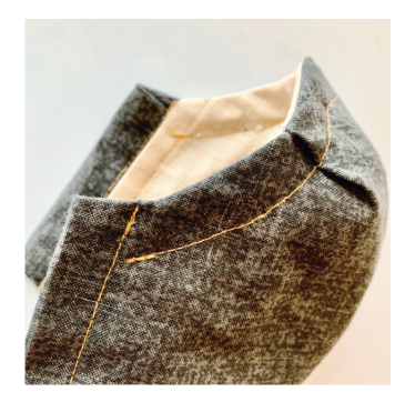
10. Sew the wire channel down 1/2" from the top edge. Do not sew past the tie channel seam.