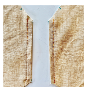
4. Sew lining edges only. Do not sew outer edge pieces at this time.