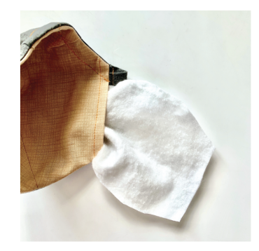
13. Insert filter material into the mask pocket ensuring it fully covers nose and mouth.

14. Dispose of filter after each use (avoid self-contamination) and wash mask (in delicates bag) in hot water and dry on high heat. The wire and ties can be removed during washing to extend their life. If making masks for others, wash again prior to distributing.