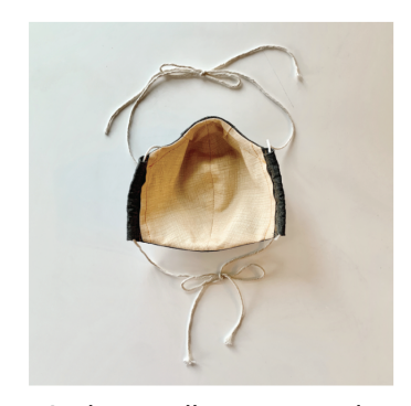
12. Elastic will wrap around the ears while the string will tie behind the head. Tying behind the head results in a better fit. If using elastic, tuck knots into the channel.