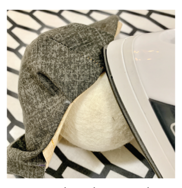
7. Turn right-side out and press the top and bottom seams (a wool dryer ball works well).