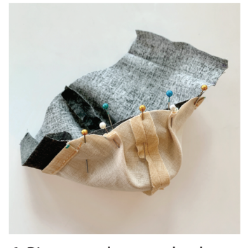
6. Pin nose pleats on both outer and lining pieces. Place the two pieces right-sides together and sew the top and bottom. Start and stop at lining edge (DO NOT sew over outer tie channel).