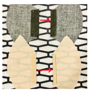
3. Press the sides of each piece - 1/4" and 5/8" on outer piece. On lining press 5/8", then press half of the 5/8" SA into seam to hide raw edge.