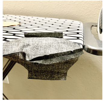
5. Place the two outer pieces right-side together and sew the middle seam. Press the seam open (edge of ironing board works well). Repeat with lining pieces.