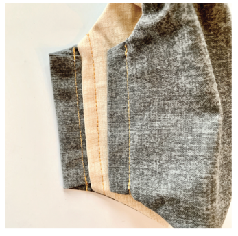
9. Sew the tie channel down 1/2" from the edge. Ensure outer and lining pieces are open on the side creating a pocket for the filter.